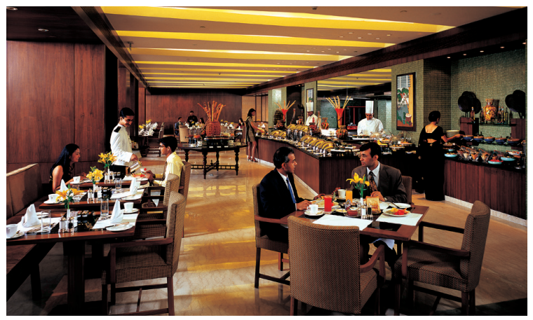
Eden Pavilion - ITC Sonar, Kolkata