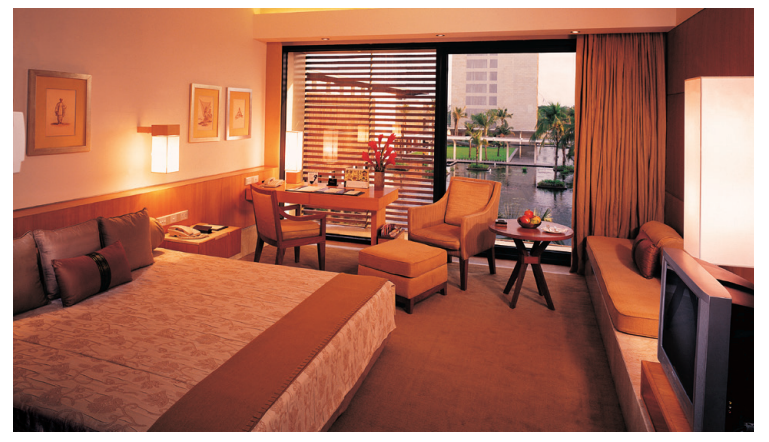
Executive Club - ITC Sonar, Kolkata