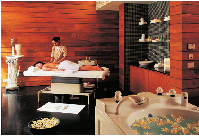
Therapy room - ITC Sonar, Kolkata

A fully equipped spacious wellness centre, swimming pool, jogging track, beauty parlour and salon services.