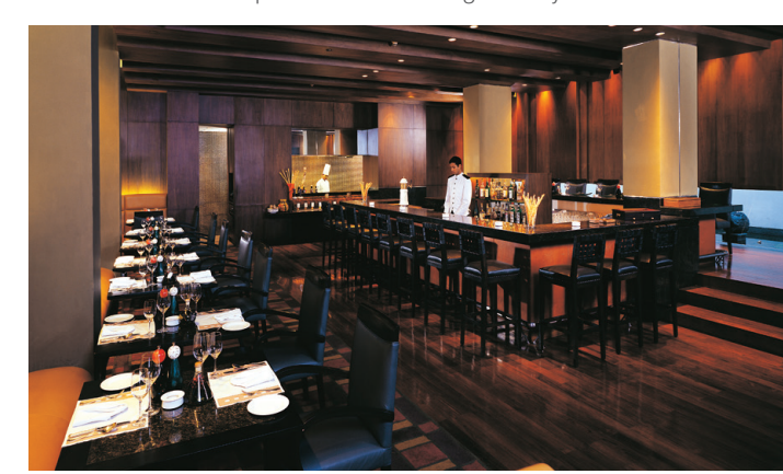
West View - ITC Sonar, Kolkata

Note: We welcome persons above the age of 18 years