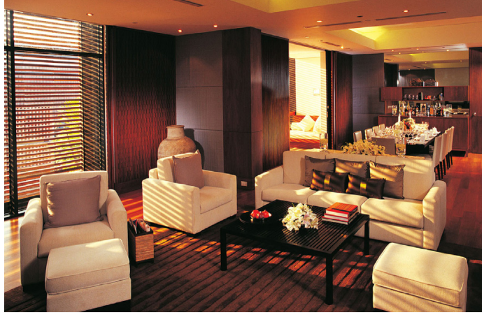
Presidential Suite - ITC Sonar, Kolkata

Spread across 172 m<sup>2</sup>, the Presidential Suite includes a sitting area, a dining area with a balcony, a bar, a pantry, butler's room, cloak room, a bedroom with a balcony, a dressing area and much more.