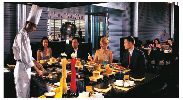
Pan Asian - ITC Sonar, Kolkata

India's finest Asian cuisine restaurant, Pan Asian brings an award winning repertoire of culinary traditions from across East and South East Asia to Kolkata, Savour the flavours of Japan, China. Mongolia, Korea, Thailand, Indonesia, Burma, and more.