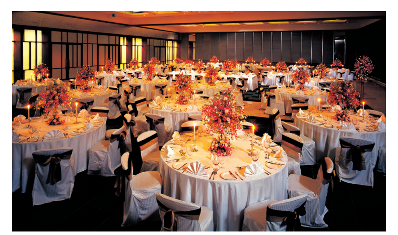
Banquet - ITC Sonar, Kolkata

A 650 m² rectangular column free Hall that divides into two areas with two exclusive pre-function areas. A reception area for 1000 guests and seating theatre style for 700 guests. A personalised conference coordinator for each event, in-built multi-projector, multiscreen audio-visual slides and overhead facilities.